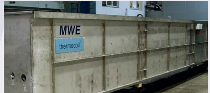
thermocoil® cooling box (two strands) in work shop.

MWE, using the thermocoil® process and the APROCS control system for wire rod cooling lines, also developed for bar rolling mills, has adapted forward-looking processes to achieve cutting-edge product grades in rod mills.