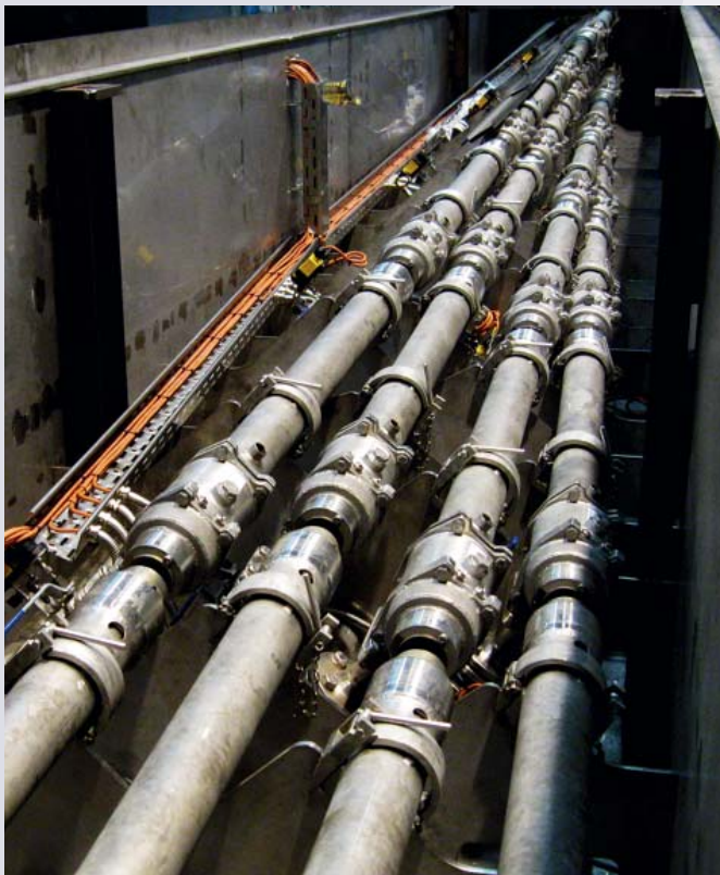
Four strand cooling pipe installation in special twisted mode.